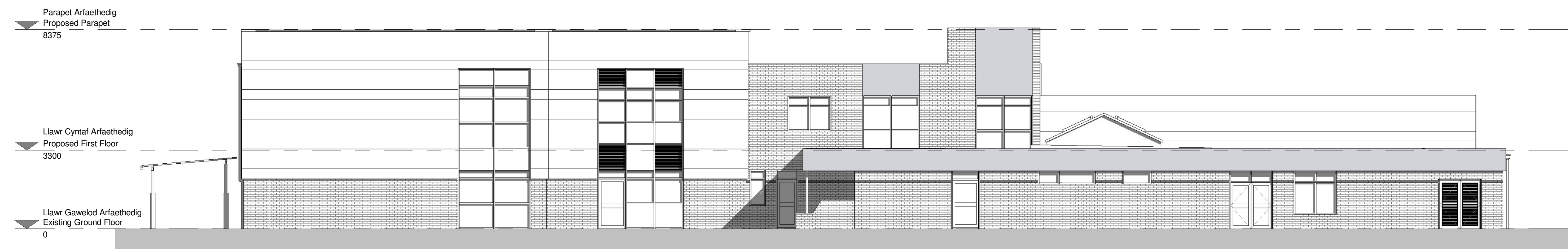
Gogledd Ddwyrain North East 1 : 100