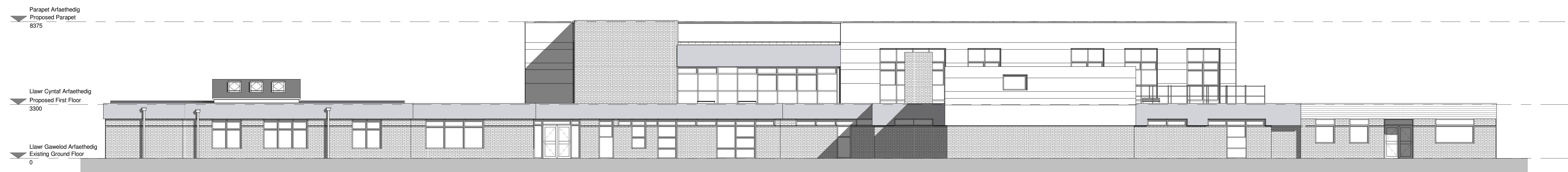
Gogledd Orllewin North West 1:100

Nodlaidu Cyfractorion 1. Contractor i wirio pob mesuriad a ffeiliau datwm ar y safle. 2. Pob mesur yrru yn eiddo TACP Architects Ltd yn unig ac nid oes hawl i'w defnyddio heb ganiatâd cyffwrdd. 3. Mae pob argraffiad, manylion a'w hyswairt yn eiddo TACP Architects Ltd. 4. Peidiwch a thynnu graddfa o'r lunlunedd. 5. Rhaid bod mesuriad gael ei wirio ar y safle cyn cyrchyn lunlunedd gweithdy, cynhyrchu ac phob anghyngedig gael eu adrodd yn y TACP Architects Ltd. General Notes 1. Contractor to verify all dimensions and check level datums on site 2. All of the designs are the sole property of TACP Architects Ltd and may not be used without their written agreement 3. All pit prints, specifications and their copyright are the property of TACP Architects Ltd 4. Do not scale off drawings 5. All dimensions shall be checked on site before commencement of shop drawings, manufacture and all discrepancies must be reported to TACP Architects Ltd