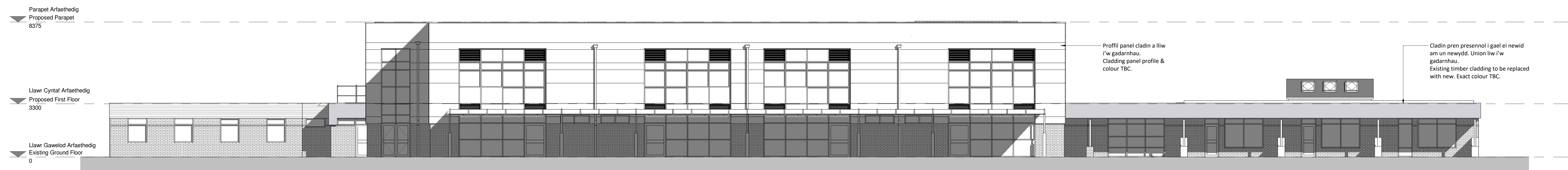
De Ddwyrain South East 1 : 100